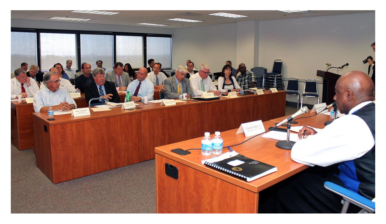
The Port of Wilmington Expansion Task Force Meeting on September 30, 2015.

The Port of Wilmington is the national leader in key import/export commodities. It is the busiest terminal on the Delaware River. It primarily serves as an import destination, with exports growing at a faster rate than imports. The Port of Wilmington will soon be near capacity.